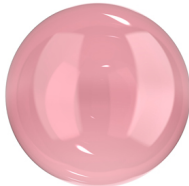
Ruby - RUB