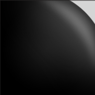
Matte Black - MBK