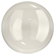
Tobacco - TOB