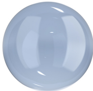
Sky Blue - SKB