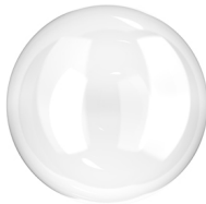
Transparent - TRA