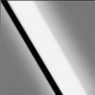
Chrome - CHR